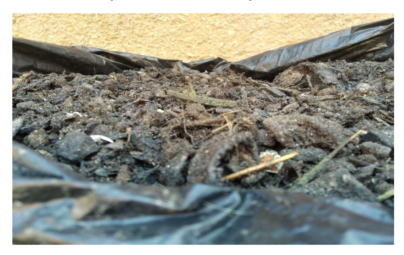
Sample of the biofertilser made after the training

At the end of the training, the team was able to make 25kg of bio-fertiliser.