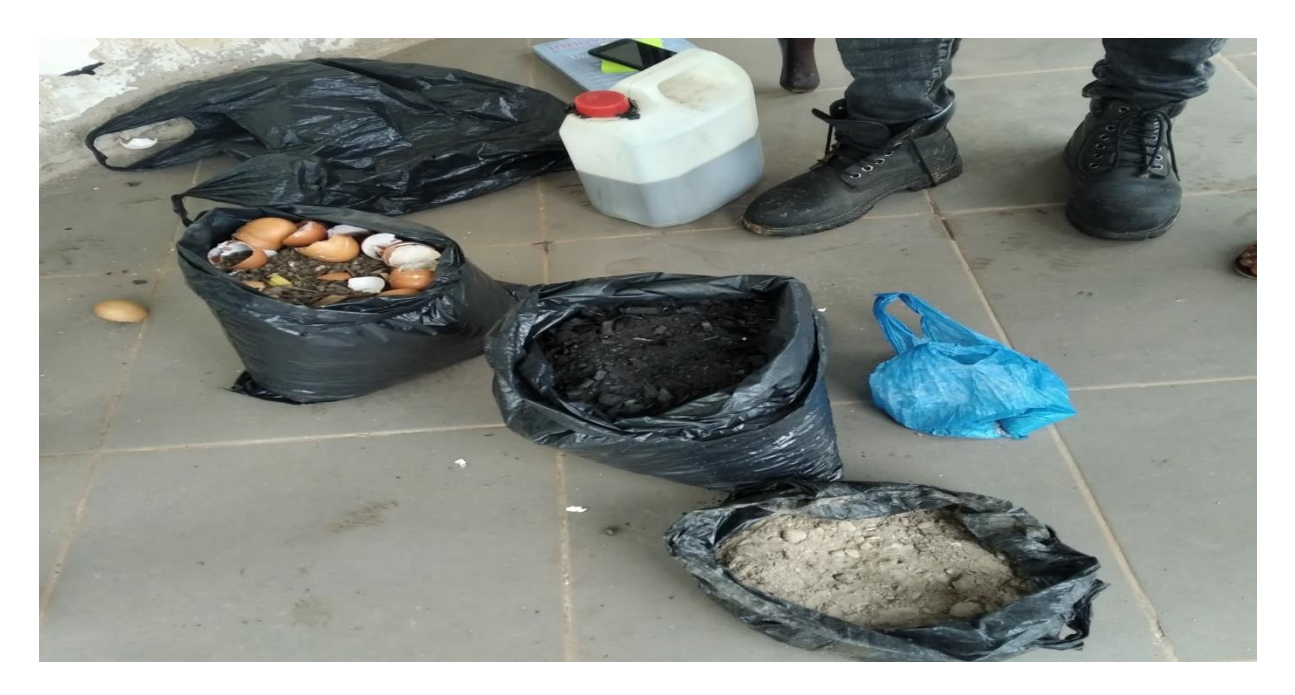
Basic ingredients for making bio-fertilizer

The plant tea has two years life span undiluted and comprised of the three main nutrients; Nitrogen, Phosphorus and Potassium.