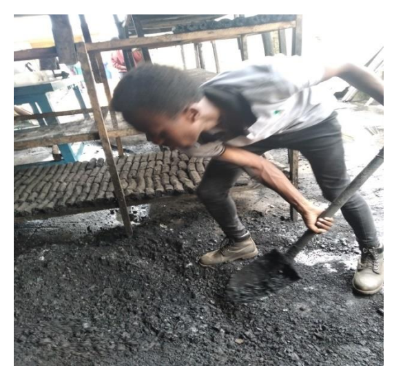
Mixing of the material (adding binder and filler)