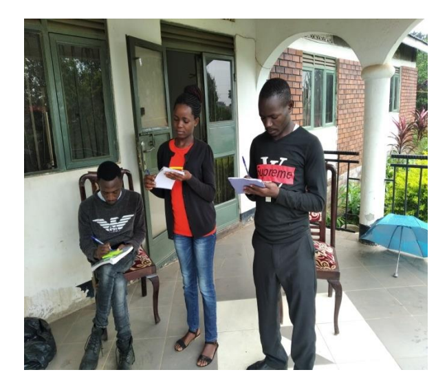
Team receiving introduction and theoretical background of Biochar