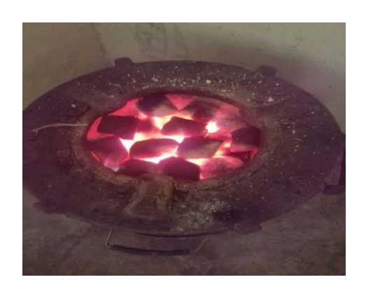
Initial lighting and ignition done in open air