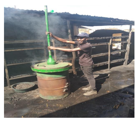
Sorting of the material for carbonizing