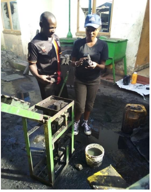
Molding of briquettes using hands Molding of briquettes using manual presser machine