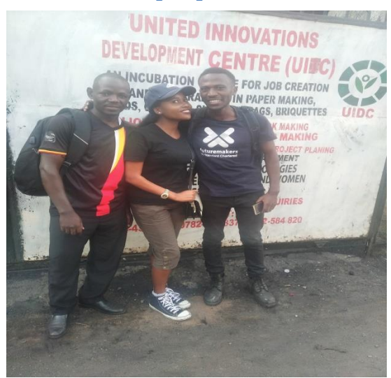
Annex 1: Sample pictures of the team undertaking briquette training.