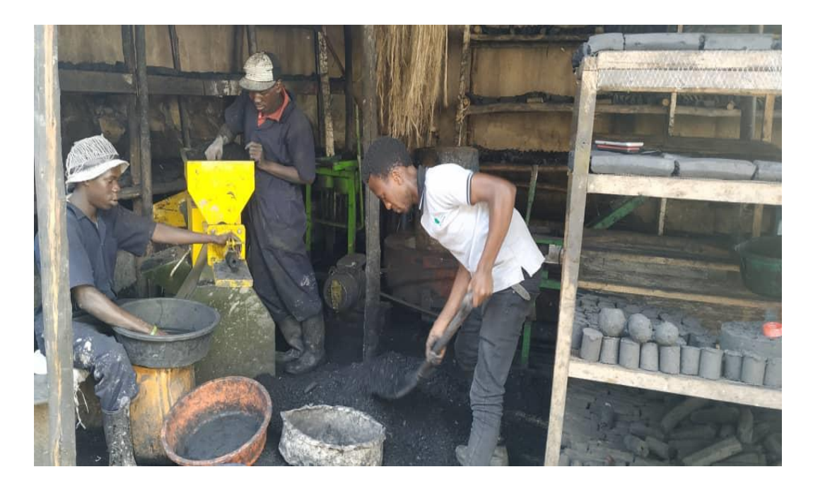
Filling the electrical machine with material during the production process

Electrical briquette making; this involved use of an electrical powered machine to make briquettes. The machine is fed with the carbonized material into the automated machine which compacts them and extrudes the briquettes. The end product from this particular machine is of good quality compared to the manually produced products.