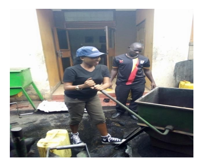
Crushing the carbonized material.