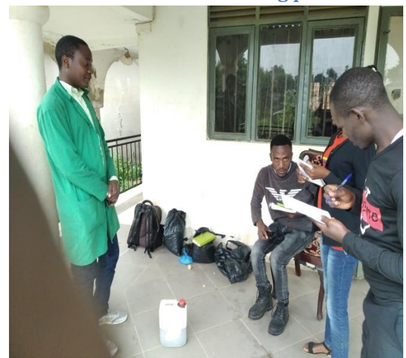
Annex 2: Bio fertilizer Training pictures