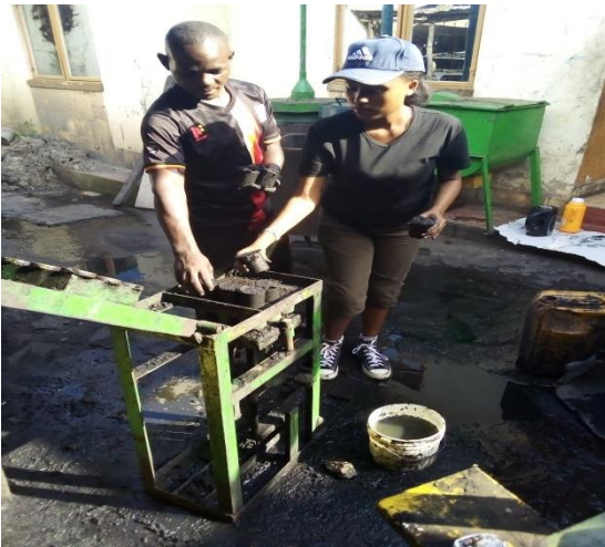
Actual production of briquettes