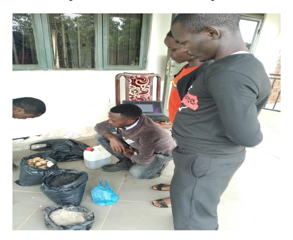
Team make a close observation of the materials for making biofertilizer