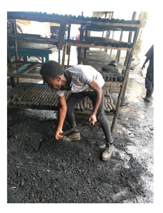
Mixing of the carbonized material