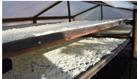
Photo: solar dryer application to demonstrate implementation of US2241:2020 standard