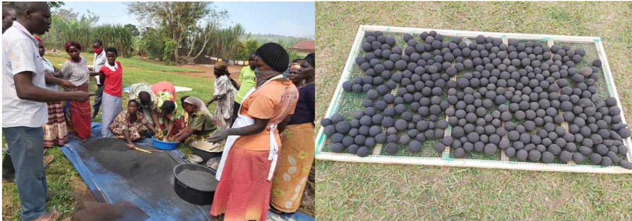
Photo: community members training in making fuel briquettes

to enable up to 9 VSLAs to access briquettes machines. The images below illustrate the briquettes training.