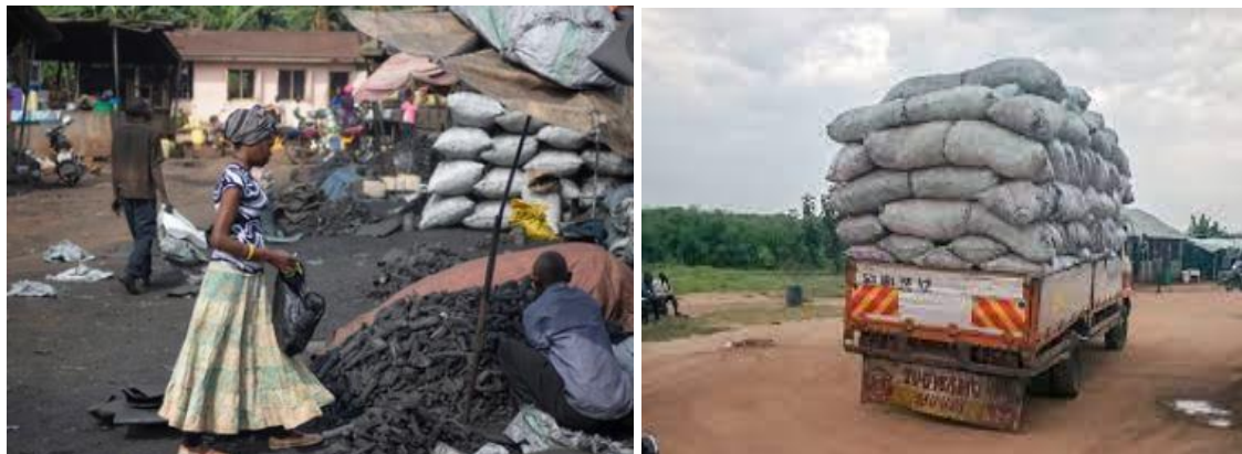
Photo: Charcoal vending & transportation

On agro-value addition, it was established that open sun drying is the most predominant method used to dry/preserve food products, including cassava, a major strategic crop in the area. The study also established that, on average, one farmer loses up to 20,000 UGX due to post-harvest. This translates to losing up to 80% of their product after every farming period. The study also established that 56% of the respondents knew about solar dryers and usage, while 36% did not know. The study also found out that all those interviewed – 100% would like to shift to using solar dryers – with 70.4% not minding sharing the dryers in a communal model. In comparison, 29.6% preferred to be allocated dryers individually.