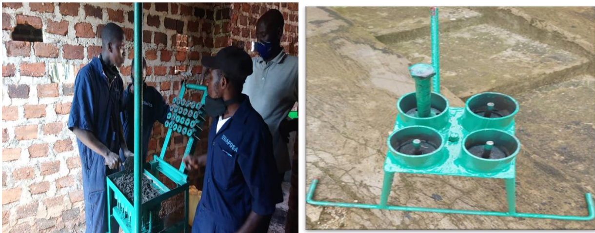
Photo: youth training in making briquettes machines

The reports attached below expound further on the above actions and impacts.