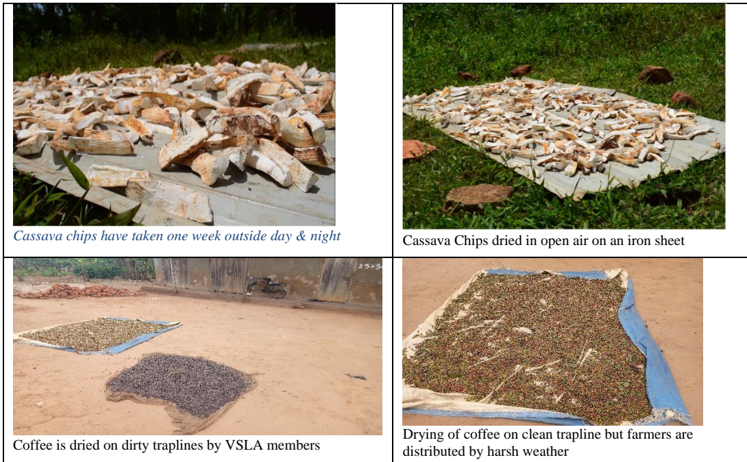
Photo: produce drying in the open sun, exposed to the elements, hence being unhygienic.

The images below further illustrate the survey findings.