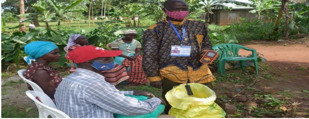
Photo: data collection to demonstrate effectiveness of solar dryers in actualising the requisite moisture content values as stipulated in UNBS standards to ensure food safety.

The attached reports further elaborate on the above.