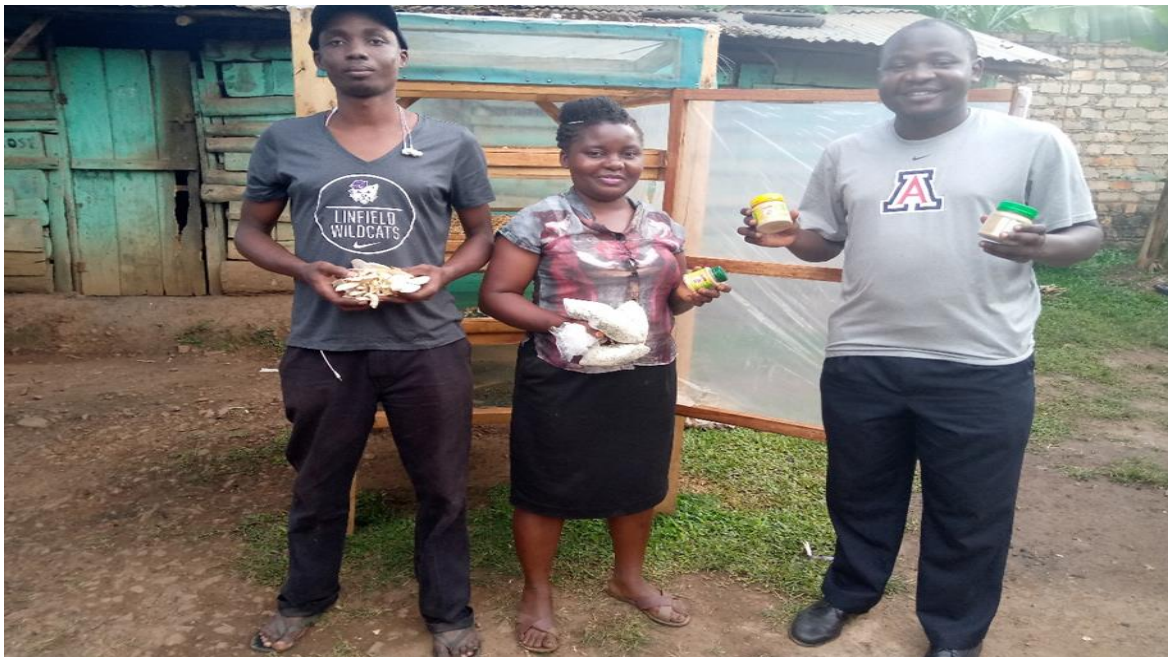
Photo: value-added cassava made from cassava dried using solar dryers.

- on EBA, trained farmers, were guided to apply diverse EBA approaches. One of the leading VSLAs managed to cultivate harvest up to 7 tonnes of fast-maturing cassava grown using EBA. Market sales earned them UGX1,400,000, equivalent to $392. At the same time, another VSLAs earned a total of 1,125,000 UGX, equivalent to $315, from the sale of 450kgs of EBA cultivated beans. At the same time, the distribution of cassava cuttings as an EBA approach of using drought-resistant crops resulted in the distribution of 375,000 cassava cuttings to cover 125acres, benefiting 60 farmers directly and up to 600 persons of their households indirectly. In addition, a total of 23 acres of multiplication sites cultivated using EBA were established to supply planting material to an additional 93 acres and benefit up to 138 more farmers in the coming season. All this will expand coverage of EBA among agro-value chain actors and enhance demand-driven upscaling. The photos below further illustrate this EBA uptake.