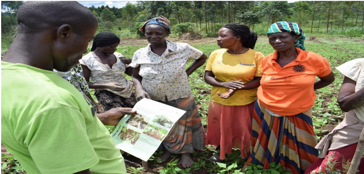
Photo: training on EBA application underway

- On EBA training, up to 150 persons drawn from 5 VSLAs benefited from this training. Among the impacts of this training, one of the leading VSLAs applied intercropping and harvested 450 kilograms of beans, which earned a total of 1,125,000 UGX equivalent to $315. The images below illustrate this EBA training.