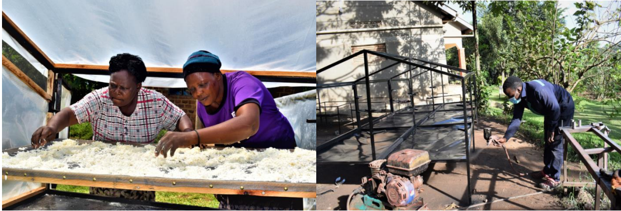
Photo left: women trained in solar dryer application test their skills on practical application. Right: youth trained in fabricating solar dryer test skills on practical application.

- On EBA training, up to 150 persons drawn from 5 VSLAs benefited from this training. Among the impacts of this training, one of the leading VSLAs applied intercropping and harvested 450 kilograms of beans, which earned a total of 1,125,000 UGX equivalent to $315. The images below illustrate this EBA training.