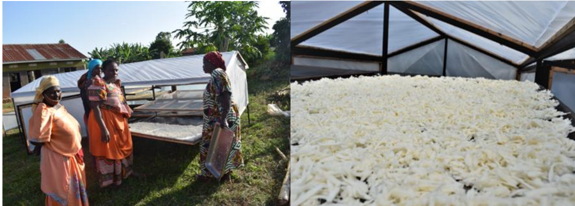
Photos: solar dryers applied to dehydrate cassava and ready for processing /storage/consumption