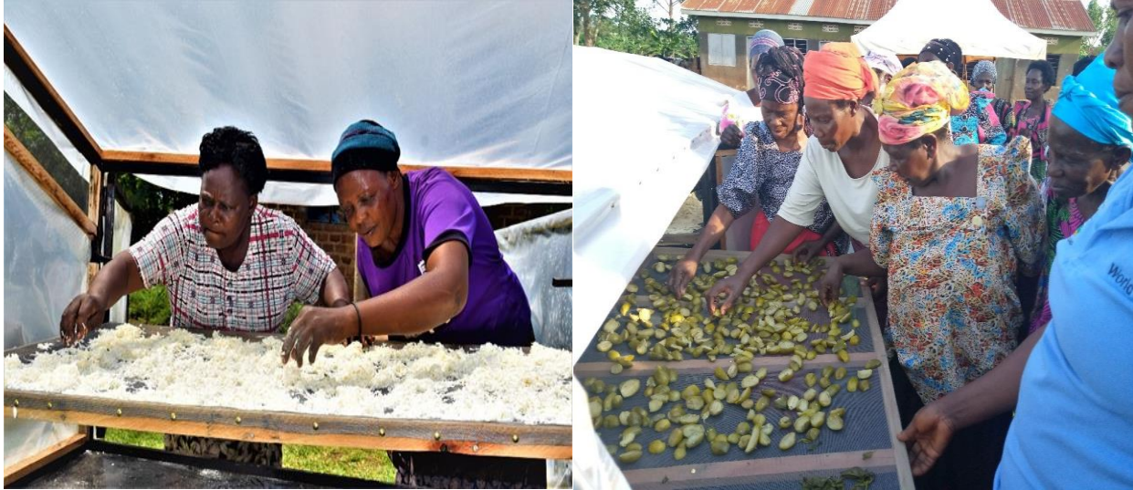
Photos: VSLAs members engaged in application of climate action solutions.

The attached reports further elaborate on these impacts.