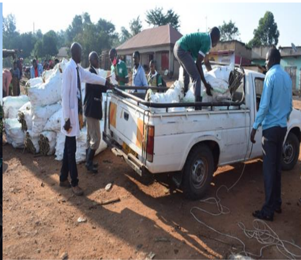
Photo: distribution of cassava cuttings to the community as an EBA strategy of drought-resistant crops